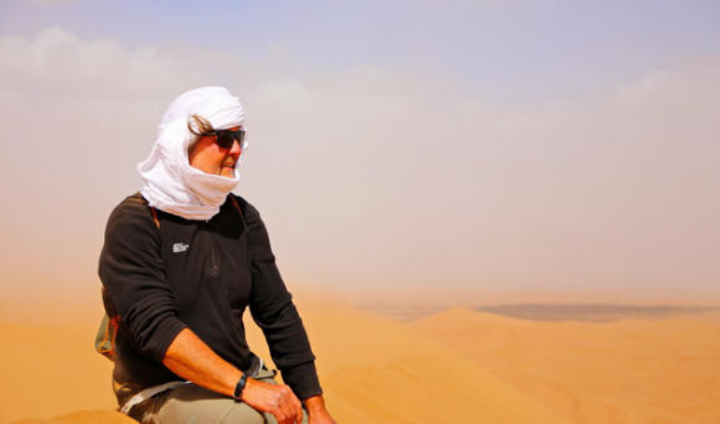
Road Trip Marokko Erg Chegaga