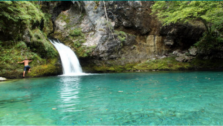
Road Trip Albania The Blue Eye of Theth

Individual Traveling Road Trips City Trips