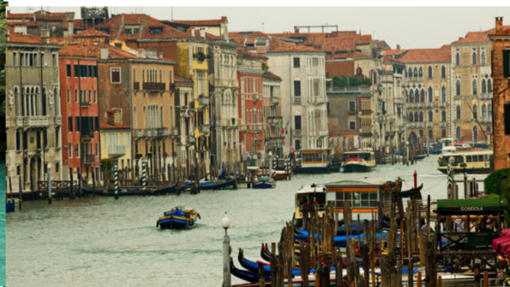
Venice City Trip Italy