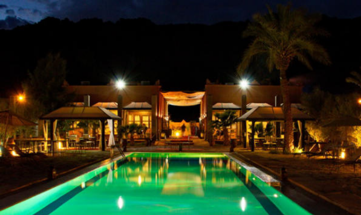
Bab Rimal Desert Hotel Morocco