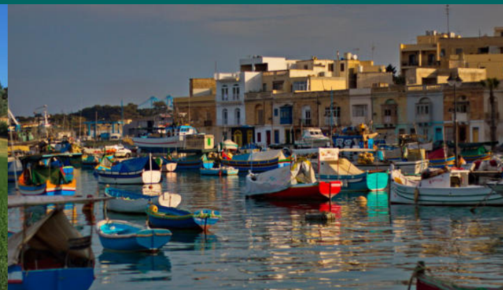
Road Trip Italy Off-road in Tuscany Candlelight-Dinner Sicily Cefalú