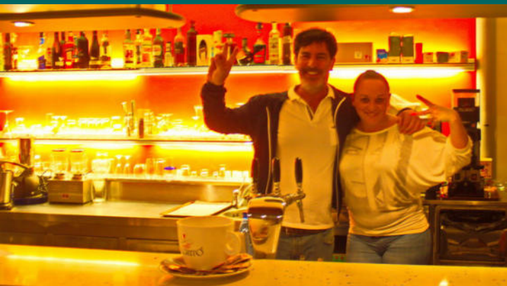
Beach Bar Trapani Sicily