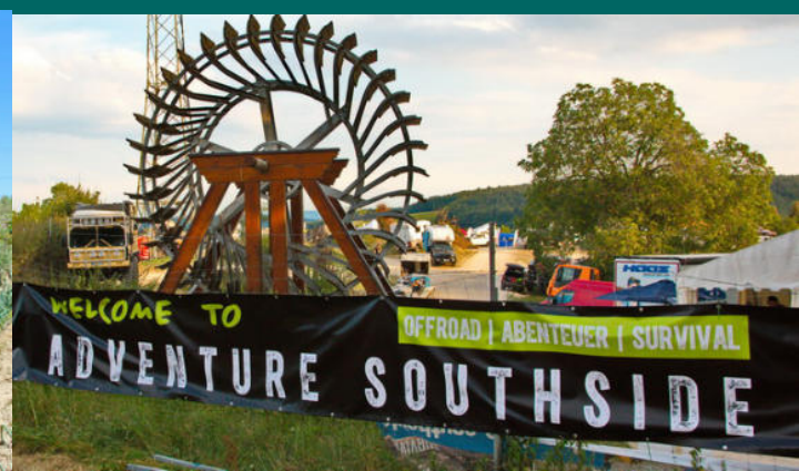
Adventure Southside Fair report