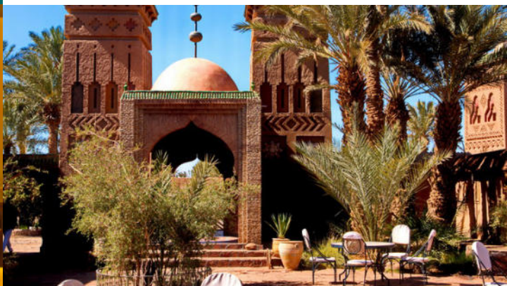
Hotel Chez le Pacha Morocco